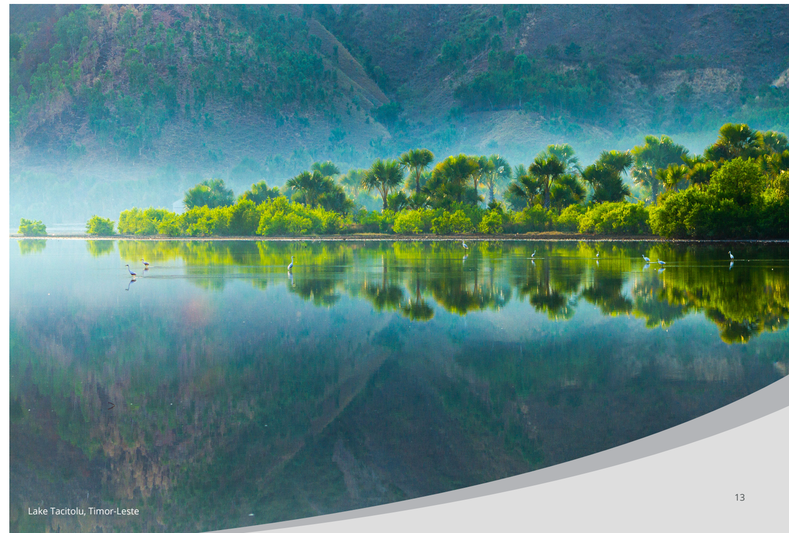
Lake Tacitolu, Timor-Leste

Civil service management enables governments to manage the civil service cycle from recruitment through retirement. This includes human resources and workforce, payroll, pensions, benefits and self-service.