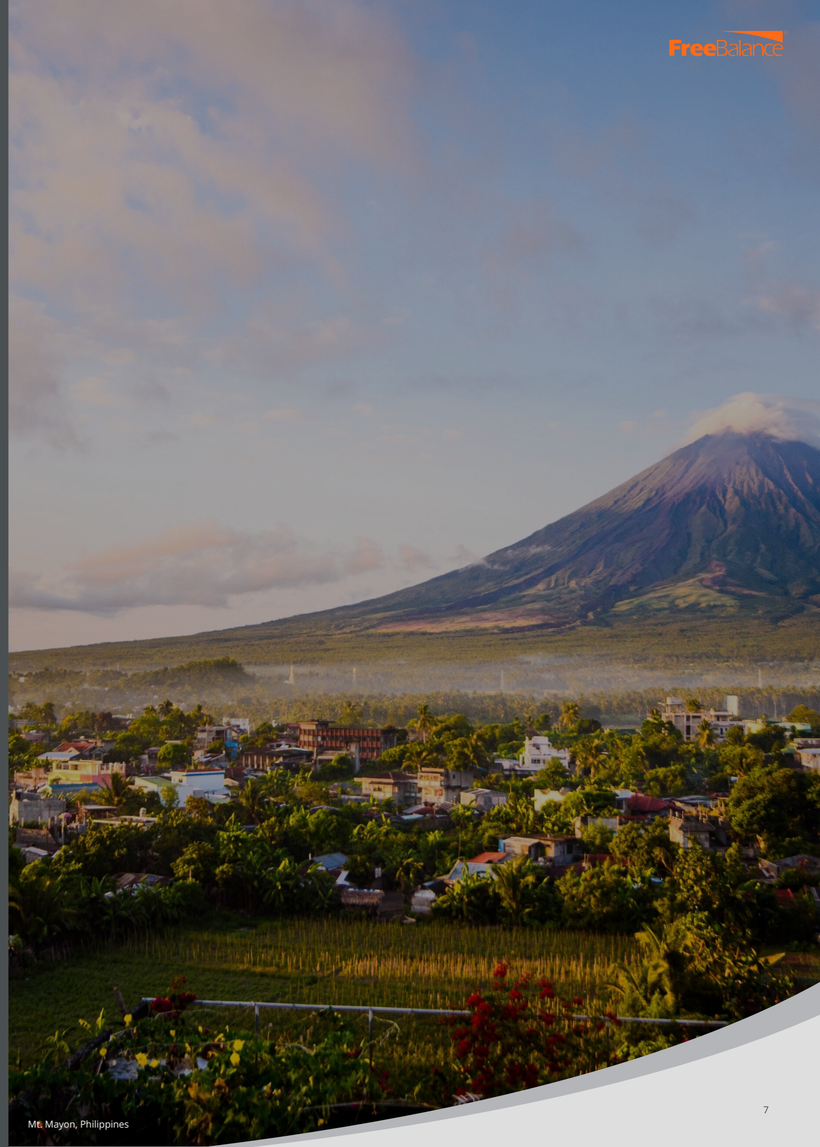
Mt. Mayon, Philippines